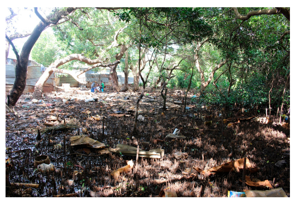
Figure 3. Recent cutting (2020) of Avicennia marina (Forssk.) Vierh. and Ceriops tagal (Pers.) C.B.Rob. next to the slum neighborhood of Iloni.

ranked third after R. mucronata . The latter is easily visible by people crossing over to the sea through paths, and easily recognizable thanks to its stilt roots.